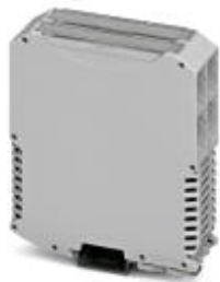
DIN rail housing, Complete housing with metal foot catch, tall design, with vents, width: 35 mm, height: 99 mm, depth: 114.5 mm, color: light gray (7035)

Please be informed that the data shown in this PDF Document is generated from our Online Catalog. Please find the complete data in the user's documentation. Our General Terms of Use for Downloads are valid ( http://phoenixcontact.com/download )