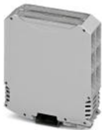
DIN rail housing, Complete housing with metal foot catch, tall design, with vents, width: 35 mm, height: 99 mm, depth: 114.5 mm, color: light gray (7035)

Please be informed that the data shown in this PDF Document is generated from our Online Catalog. Please find the complete data in the user's documentation. Our General Terms of Use for Downloads are valid ( http://phoenixcontact.com/download )