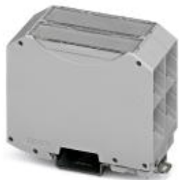
DIN rail housing, Complete housing with metal foot catch, ultra-flat design, without vents, width: 45 mm, height: 85 mm, depth: 70.4 mm, color: light gray (7035)

Please be informed that the data shown in this PDF Document is generated from our Online Catalog. Please find the complete data in the user's documentation. Our General Terms of Use for Downloads are valid ( http://phoenixcontact.com/download )