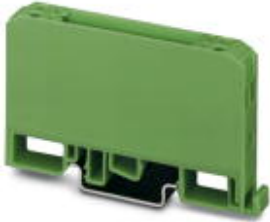
Component housing, Lower part

The figure shows a version of the product