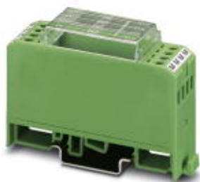
Diode module, with four diodes, common anode, diode type 1N 5408

Please be informed that the data shown in this PDF Document is generated from our Online Catalog. Please find the complete data in the user's documentation. Our General Terms of Use for Downloads are valid ( http://phoenixcontact.com/download )