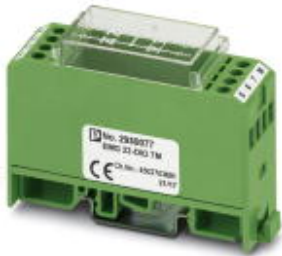
Diode module, with 7 diodes, common anode, diode type 1N 4007

Please be informed that the data shown in this PDF Document is generated from our Online Catalog. Please find the complete data in the user's documentation. Our General Terms of Use for Downloads are valid ( http://phoenixcontact.com/download )