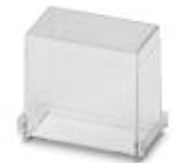
Covering hood, for the contact and dust-protected encapsulation of the components, in transparent design. Height: 35 mm, width: 22.5 mm

Covering hood - EMG 22-H 35MM KLAR - 2942771