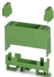
Electronic housing set, consisting of electronic housing and printed circuit termination blocks, pitch 5

Please be informed that the data shown in this PDF Document is generated from our Online Catalog. Please find the complete data in the user's documentation. Our General Terms of Use for Downloads are valid ( http://phoenixcontact.com/download )