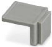
Equipment marker, narrow

Marking material - EMG-SGKS 10 - 2947585