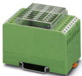
Diode module, with eight diodes, common anode, diode type 1N 5408

Please be informed that the data shown in this PDF Document is generated from our Online Catalog. Please find the complete data in the user's documentation. Our General Terms of Use for Downloads are valid ( http://phoenixcontact.com/download )