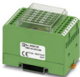
Diode module, with 14 diodes, common anode, diode type 1N 4007

Please be informed that the data shown in this PDF Document is generated from our Online Catalog. Please find the complete data in the user's documentation. Our General Terms of Use for Downloads are valid ( http://phoenixcontact.com/download )