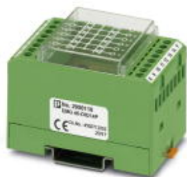
Diode module, for extension with 14 1N 4007 diodes, with a common cathode

Please be informed that the data shown in this PDF Document is generated from our Online Catalog. Please find the complete data in the user's documentation. Our General Terms of Use for Downloads are valid ( http://phoenixcontact.com/download )