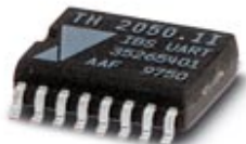
Protocol chip, in SOP 16 housing

Please be informed that the data shown in this PDF Document is generated from our Online Catalog. Please find the complete data in the user's documentation. Our General Terms of Use for Downloads are valid ( http://phoenixcontact.com/download )