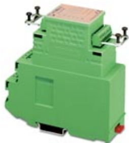
INTERBUS-ST module, with RS-232-C, RS-485 and RS-422 interface, for serial data transmission, IP20 protection, V.24

Please be informed that the data shown in this PDF Document is generated from our Online Catalog. Please find the complete data in the user's documentation. Our General Terms of Use for Downloads are valid ( http://phoenixcontact.com/download )