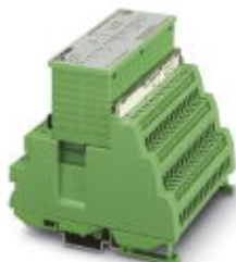
Replacement module electronics for IBS ST (ZF) 24 BK DIO 8/8/3-T

Please be informed that the data shown in this PDF Document is generated from our Online Catalog. Please find the complete data in the user's documentation. Our General Terms of Use for Downloads are valid ( http://phoenixcontact.com/download )