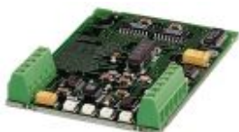
Universal I/O module in the form of a daughterboard

Please be informed that the data shown in this PDF Document is generated from our Online Catalog. Please find the complete data in the user's documentation. Our General Terms of Use for Downloads are valid ( http://phoenixcontact.com/download )