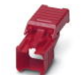
Lockable security element

Port Guard Security Element - FL PATCH GUARD - 2891424