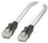
Patch cable, CAT5, assembled, 2 m

Patch cable - FL CAT5 PATCH 2,0 - 2832289