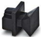
Dust protection caps for RJ45 socket

Dust protection - FL RJ45 PROTECT CAP - 2832991