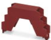
Upper part of the housing

Upper part of housing - ME 22,5 OT-3MSTBO RD - 2697181