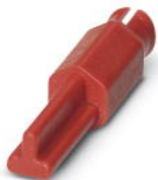
Coding profile for HC-D 7-ESTC-COD pin contact inserts

Please be informed that the data shown in this PDF Document is generated from our Online Catalog. Please find the complete data in the user's documentation. Our General Terms of Use for Downloads are valid ( http://phoenixcontact.com/download )