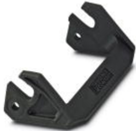
Single locking latch for B16 housing, HC-EVO...AL and HC-STA...AL

Please be informed that the data shown in this PDF Document is generated from our Online Catalog. Please find the complete data in the user's documentation. Our General Terms of Use for Downloads are valid ( http://phoenixcontact.com/download )