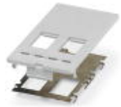
Front plate, plastic with shroud, for 2x RJ with modular system (Keystone)

Front plate - VS-SI-FP-2RJ-MOD - 1656631