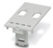
Data front plate, plastic, for 2 x 9-pos. D-SUB, item 1656961 may be required for mounting D-SUB inserts

Front plate - VS-SI-FP-DSUB9-DSUB15 - 1656576