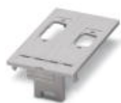
Data front plate, plastic, for 1 x 15-pos. D-SUB and 1 x 15-pos. D-SUB, item 1656961 may be required for mounting D-SUB inserts

Front plate - VS-SI-FP-DSUB9-DSUB15 - 1656576