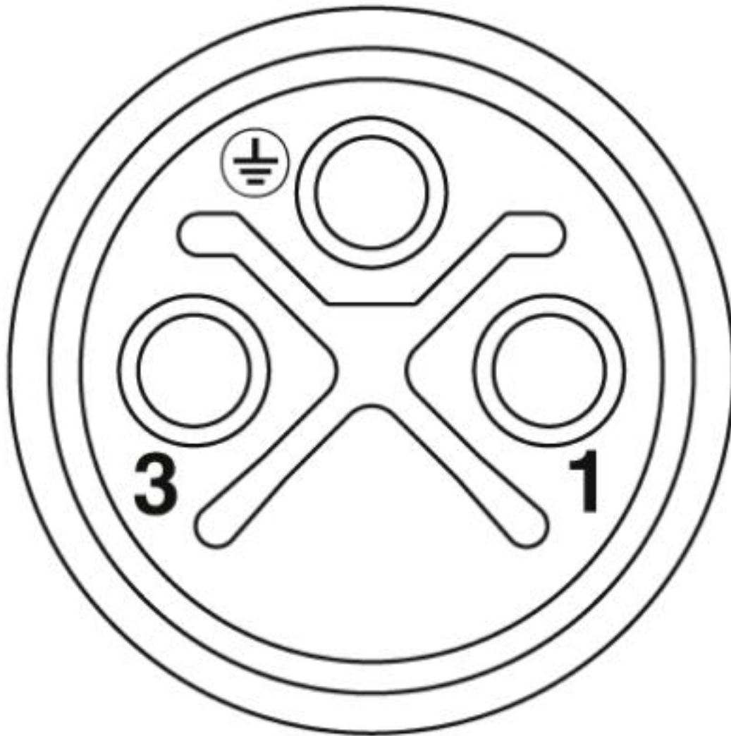
Pin assignment of M12 socket, 3-pos., S-coded, socket side view