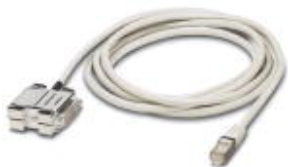
The figure shows a comparable item from Phoenix Contact

Cable adapter for PSR over-speed safety relays (PSR-RSM4 and PSR-MM30), 9/8-pos., cable length: 2.5 m, for controller: ELAU