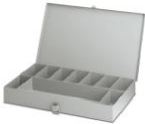
Assortment box, metal, no components mounted

Please be informed that the data shown in this PDF Document is generated from our Online Catalog. Please find the complete data in the user's documentation. Our General Terms of Use for Downloads are valid ( http://phoenixcontact.com/download )