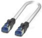
Patch cable, CAT6, pre-assembled, 2.0 m

Patch cable - FL CAT6 PATCH 2,0 - 2891589