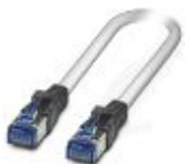
Patch cable, CAT6, pre-assembled, 1.0 m

Patch cable - FL CAT6 PATCH 1,0 - 2891385