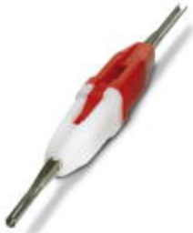
Insertion/extraction tool, to insert and extract the D-SUB standard signal contacts

Please be informed that the data shown in this PDF Document is generated from our Online Catalog. Please find the complete data in the user's documentation. Our General Terms of Use for Downloads are valid ( http://phoenixcontact.com/download )