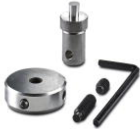
Stamping bit, for bore holes: 6.4 mm diameter

Please be informed that the data shown in this PDF Document is generated from our Online Catalog. Please find the complete data in the user's documentation. Our General Terms of Use for Downloads are valid ( http://phoenixcontact.com/download )