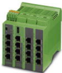
Rail-mountable Ethernet hub with 16 RJ45 ports, supports Ethernet with 10 Mbps as well as 100 Mbps

Please be informed that the data shown in this PDF Document is generated from our Online Catalog. Please find the complete data in the user's documentation. Our General Terms of Use for Downloads are valid ( http://phoenixcontact.com/download )