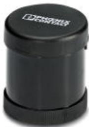
Buzzer element, continuous/pulse tone, 24 V AC/DC, max. 85 dB(A), black

Please be informed that the data shown in this PDF Document is generated from our Online Catalog. Please find the complete data in the user's documentation. Our General Terms of Use for Downloads are valid ( http://phoenixcontact.com/download )