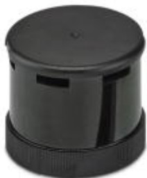
Siren element, 24 V AC/DC, max. 105 dB(A), continuous tone and alternating continuous tone

Please be informed that the data shown in this PDF Document is generated from our Online Catalog. Please find the complete data in the user's documentation. Our General Terms of Use for Downloads are valid ( http://phoenixcontact.com/download )