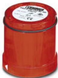
LED blinking light element, 24 V AC/DC, red

Please be informed that the data shown in this PDF Document is generated from our Online Catalog. Please find the complete data in the user's documentation. Our General Terms of Use for Downloads are valid ( http://phoenixcontact.com/download )