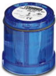
LED flashing beacon element, 24 V DC, double lightning, blue

Please be informed that the data shown in this PDF Document is generated from our Online Catalog. Please find the complete data in the user's documentation. Our General Terms of Use for Downloads are valid ( http://phoenixcontact.com/download )