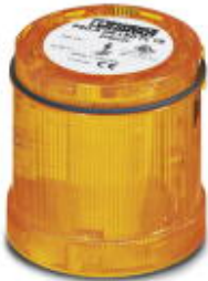
LED flashing beacon element, 24 V DC, double flash, yellow

Please be informed that the data shown in this PDF Document is generated from our Online Catalog. Please find the complete data in the user's documentation. Our General Terms of Use for Downloads are valid ( http://phoenixcontact.com/download )