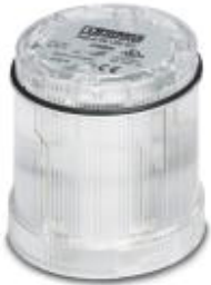
LED permanent light element, 24 V DC, 7 colors

Please be informed that the data shown in this PDF Document is generated from our Online Catalog. Please find the complete data in the user's documentation. Our General Terms of Use for Downloads are valid ( http://phoenixcontact.com/download )