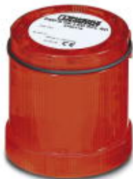
LED random flashing beacon element, 24 V DC, red

Please be informed that the data shown in this PDF Document is generated from our Online Catalog. Please find the complete data in the user's documentation. Our General Terms of Use for Downloads are valid ( http://phoenixcontact.com/download )