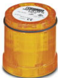
LED permanent light element, 24 V AC/DC, yellow

Please be informed that the data shown in this PDF Document is generated from our Online Catalog. Please find the complete data in the user's documentation. Our General Terms of Use for Downloads are valid ( http://phoenixcontact.com/download )