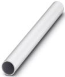
Tube, 250 mm high, Ø 25 mm

Please be informed that the data shown in this PDF Document is generated from our Online Catalog. Please find the complete data in the user's documentation. Our General Terms of Use for Downloads are valid ( http://phoenixcontact.com/download )