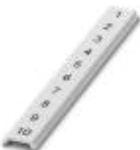
Zack Marker strip, flat, Strip, white, labeled, Printed vertically: consecutive numbers 1 ... 10, 11 ... 20, etc. up to 91 ... 100, mounting type: snap into flat marker groove, for terminal block width: 5 mm, lettering field size: 5.15 x 5.15 mm, Number of individual labels: 10

Zack Marker strip, flat - ZBF 5,QR:FORTL.ZAHLEN - 0808697