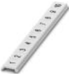
Zack Marker strip, flat, Strip, white, labeled, printed horizontally: consecutive numbers 1 ... 10, 11 ... 20, etc. up to 491 ... 500, mounting type: snap into flat marker groove, for terminal block width: 5 mm, lettering field size: 5.15 x 5.15 mm, Number of individual labels: 10

Zack Marker strip, flat - ZBF 5,LGS:FORTL.ZAHLEN - 0808671