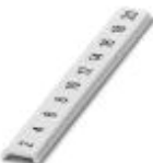
Zack Marker strip, flat, Strip, white, labeled, printed horizontally: consecutive numbers 2 ... 20, 22 ... 40, etc. up to 82 ... 100, mounting type: snap into flat marker groove, for terminal block width: 5 mm, lettering field size: 5.15 x 5.15 mm, Number of individual labels: 10

Zack Marker strip, flat - ZBF 5,LGS:GERADE ZAHLEN - 0810821