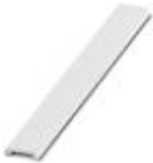
Zack Marker strip, flat, can be ordered: Strip, white, labeled according to customer specifications, mounting type: snap into flat marker groove, for terminal block width: 5 mm, lettering field size: 5.15 x 5.15 mm, Number of individual labels: 10

Zack Marker strip, flat - ZBF 5 CUS - 0825025