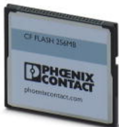
Program and configuration memory, plug-in, 256 MB

Please be informed that the data shown in this PDF Document is generated from our Online Catalog. Please find the complete data in the user's documentation. Our General Terms of Use for Downloads are valid ( http://phoenixcontact.com/download )