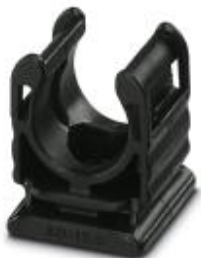
Hose holder with cover

Please be informed that the data shown in this PDF Document is generated from our Online Catalog. Please find the complete data in the user's documentation. Our General Terms of Use for Downloads are valid ( http://phoenixcontact.com/download )