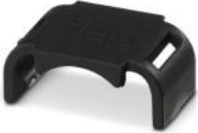
Hose holder with cover

Please be informed that the data shown in this PDF Document is generated from our Online Catalog. Please find the complete data in the user's documentation. Our General Terms of Use for Downloads are valid ( http://phoenixcontact.com/download )