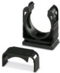
Hose holder with cover

Please be informed that the data shown in this PDF Document is generated from our Online Catalog. Please find the complete data in the user's documentation. Our General Terms of Use for Downloads are valid ( http://phoenixcontact.com/download )