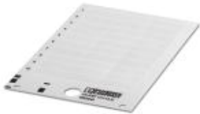
The figure shows a similar product

Snap-in markers, insert label, for marking Siemens ET 200SP controllers, card, yellow, unmarked, can be marked with: THERMOMARK CARD, mounting type: snapped into marker carrier, lettering field size: 31 x 12.5 mm