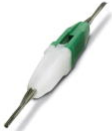
Insertion/extraction tool, to insert and extract the D-SUB high density signal contacts

Please be informed that the data shown in this PDF Document is generated from our Online Catalog. Please find the complete data in the user's documentation. Our General Terms of Use for Downloads are valid ( http://phoenixcontact.com/download )