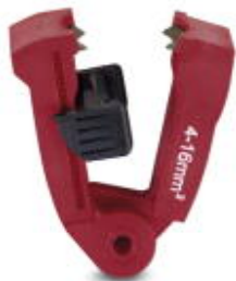
Replacement blade for WIREFOX 16, for cables and conductors of 4 - 16 mm 2

Please be informed that the data shown in this PDF Document is generated from our Online Catalog. Please find the complete data in the user's documentation. Our General Terms of Use for Downloads are valid ( http://phoenixcontact.com/download )