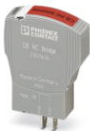
Bridge plug for bridging contacts 11 to 14 for CB base elements

Please be informed that the data shown in this PDF Document is generated from our Online Catalog. Please find the complete data in the user's documentation. Our General Terms of Use for Downloads are valid ( http://phoenixcontact.com/download )