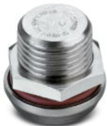
Plug, M20, for FB... enclosure

Please be informed that the data shown in this PDF Document is generated from our Online Catalog. Please find the complete data in the user's documentation. Our General Terms of Use for Downloads are valid ( http://phoenixcontact.com/download )