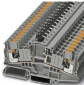
Component terminal block, with integrated P1000M diode, connection method: Push-in connection, cross section: 0.5 mm 2 - 10 mm 2 , AWG: 20 - 10, width: 8.2 mm, color: gray

Please be informed that the data shown in this PDF Document is generated from our Online Catalog. Please find the complete data in the user's documentation. Our General Terms of Use for Downloads are valid ( http://phoenixcontact.com/download )