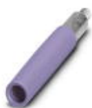
Female test connector, color: violet

Female test connector - PSBJ-URTK 6 VT - 3026421