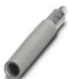
Female test connector, color: gray

Female test connector - PSBJ-URTK 6 GY - 3026612