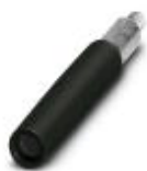
Female test connector, color: black

Female test connector - PSBJ-URTK 6 BK - 3026447