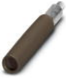
Female test connector, color: brown

Female test connector - PSBJ-URTK 6 BN - 3026971