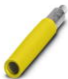
Female test connector, color: yellow

Female test connector - PSBJ-URTK 6 YE - 3026405