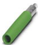
Female test connector, color: green

Female test connector - PSBJ-URTK 6 GN - 3026418