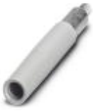
Female test connector, color: white

Female test connector - PSBJ-URTK 6 WH - 3026448