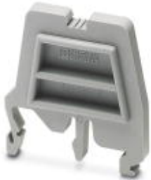
Flange cover, length: 43.3 mm, width: 5.2 mm, color: gray

Please be informed that the data shown in this PDF Document is generated from our Online Catalog. Please find the complete data in the user's documentation. Our General Terms of Use for Downloads are valid ( http://phoenixcontact.com/download )