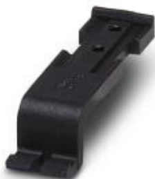
Strain relief, length: 36.7 mm, width: 9.3 mm, number of positions: 2, color: black

Please be informed that the data shown in this PDF Document is generated from our Online Catalog. Please find the complete data in the user's documentation. Our General Terms of Use for Downloads are valid ( http://phoenixcontact.com/download )