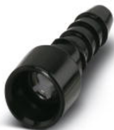
Pneumatic socket with valve, for HC-M-PN3 module, internal hose diameter of 4.0 mm

Please be informed that the data shown in this PDF Document is generated from our Online Catalog. Please find the complete data in the user's documentation. Our General Terms of Use for Downloads are valid ( http://phoenixcontact.com/download )